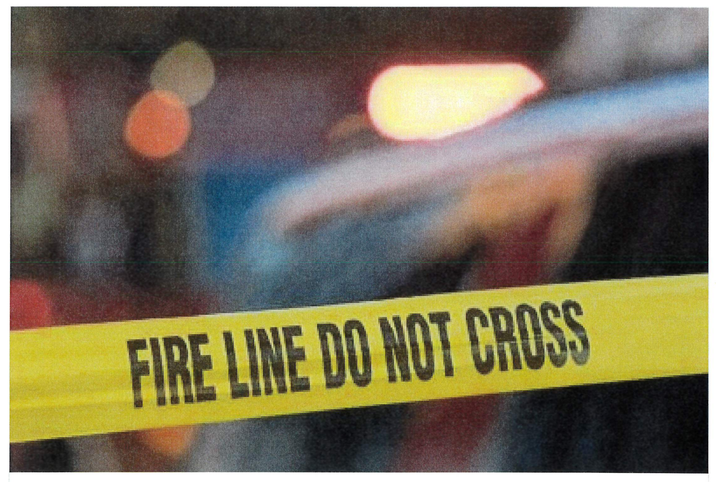
Crash that caused evacuation order in downtown Colorado Springs intentional, police say